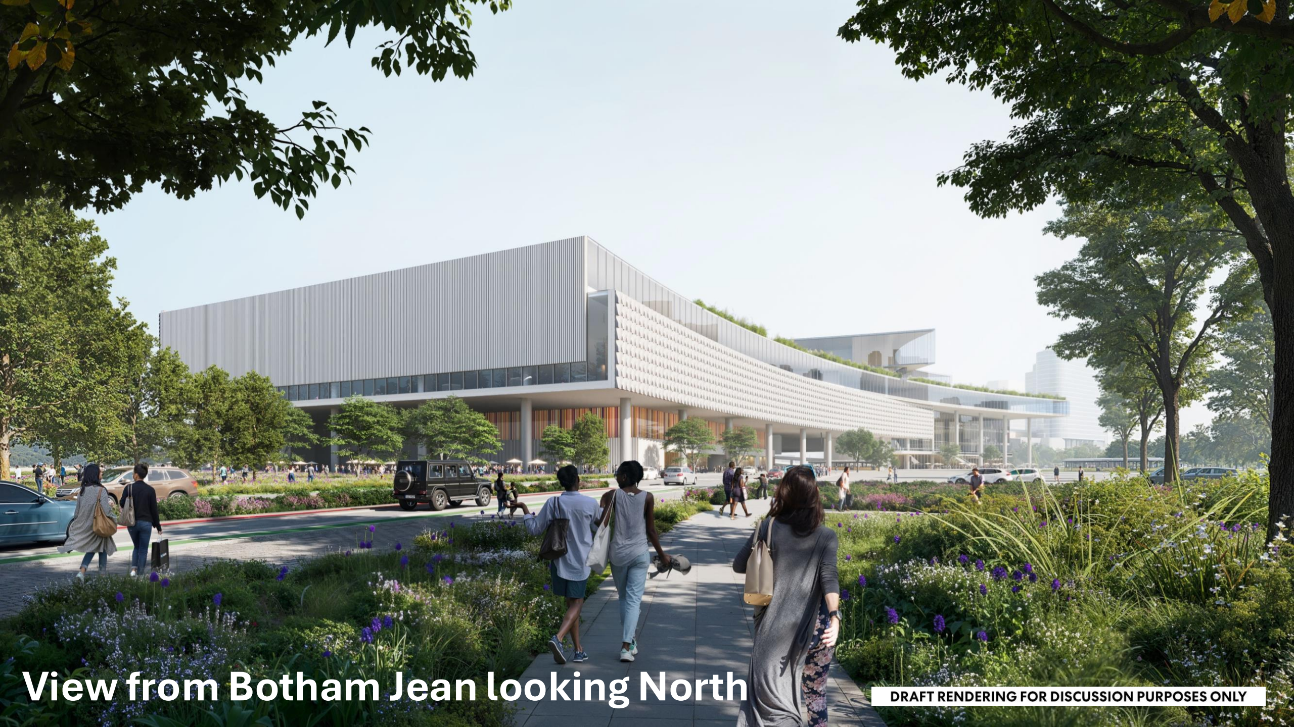
View from Botham Jean looking North

DRAFT RENDERING FOR DISCUSSION PURPOSES ONLY