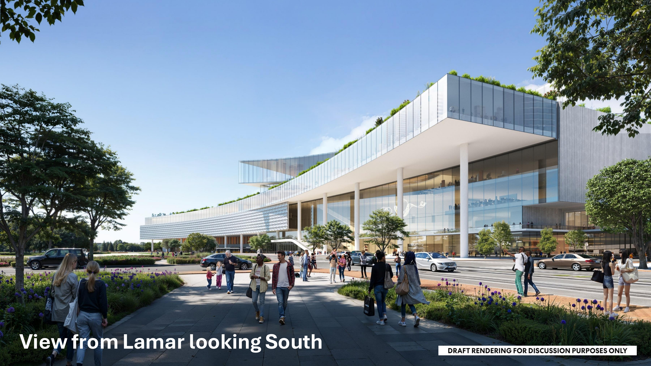
View from Lamar looking South

DRAFT RENDERING FOR DISCUSSION PURPOSES ONLY