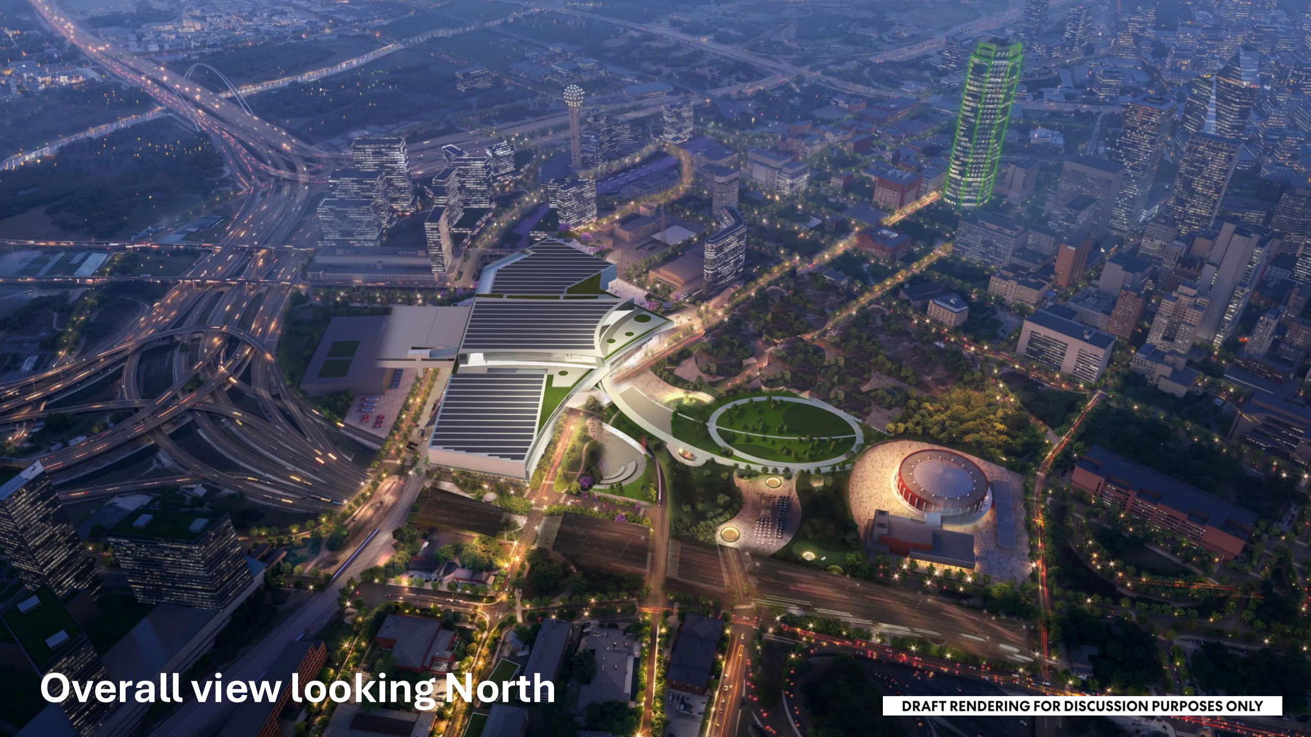
Overall view looking North

DRAFT RENDERING FOR DISCUSSION PURPOSES ONLY