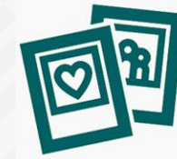
Lasting Friendships & Once-in-a-Generation Experience